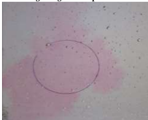
Figure 5 - Experiment on the concrete surface color of the sample with 2.5% titanium dioxide after 24 hours. Comparison of Figure 4 and 5 shows that self - cleaning properties were significantly affected by Nano TiO 2 .