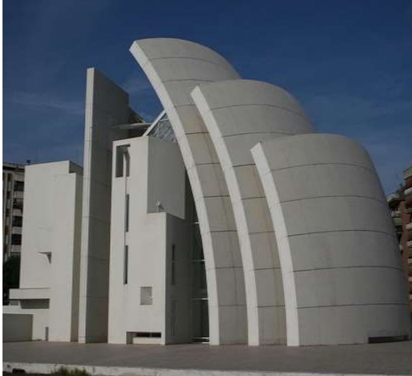
Figure 1- Jubilee Church, Rome, Italy. In the facade of this structure, concrete is used to combine titanium dioxide nanoparticles

The essential feature of the network is the existence of horizontal spider web links between its components that distinguish it from other bureaucratic structures (Gilchrist 2009). Networks facilitate social interactions and reduce transaction costs (Isett et al. 2011; Fischer, 1990).