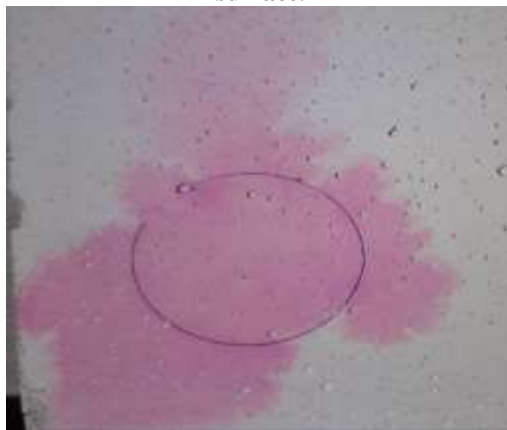
Figure 4 - Experiment on the concrete surface color of the sample with 2.5% titanium dioxide at the beginning of the experiment.