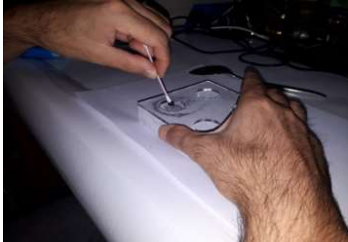
Figure 3 -Surface of concrete sample impregnated. Rhodamine B (pink) was spread on the concrete surface.